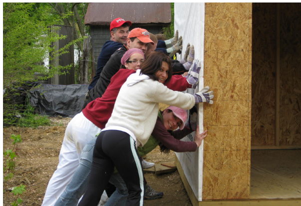
As part of their program, participants become part of their adopted community by volunteering with organizations such as Habitat for Humanity.